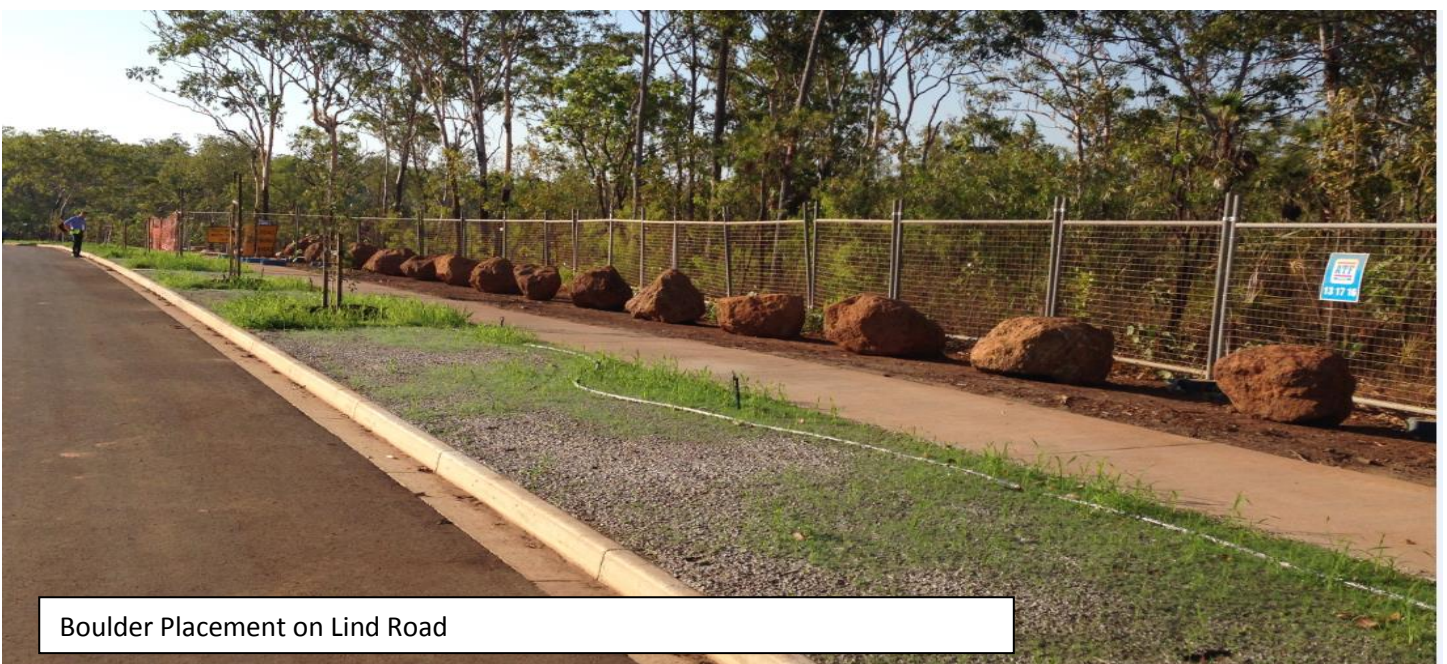
Boulder Placement on Lind Road