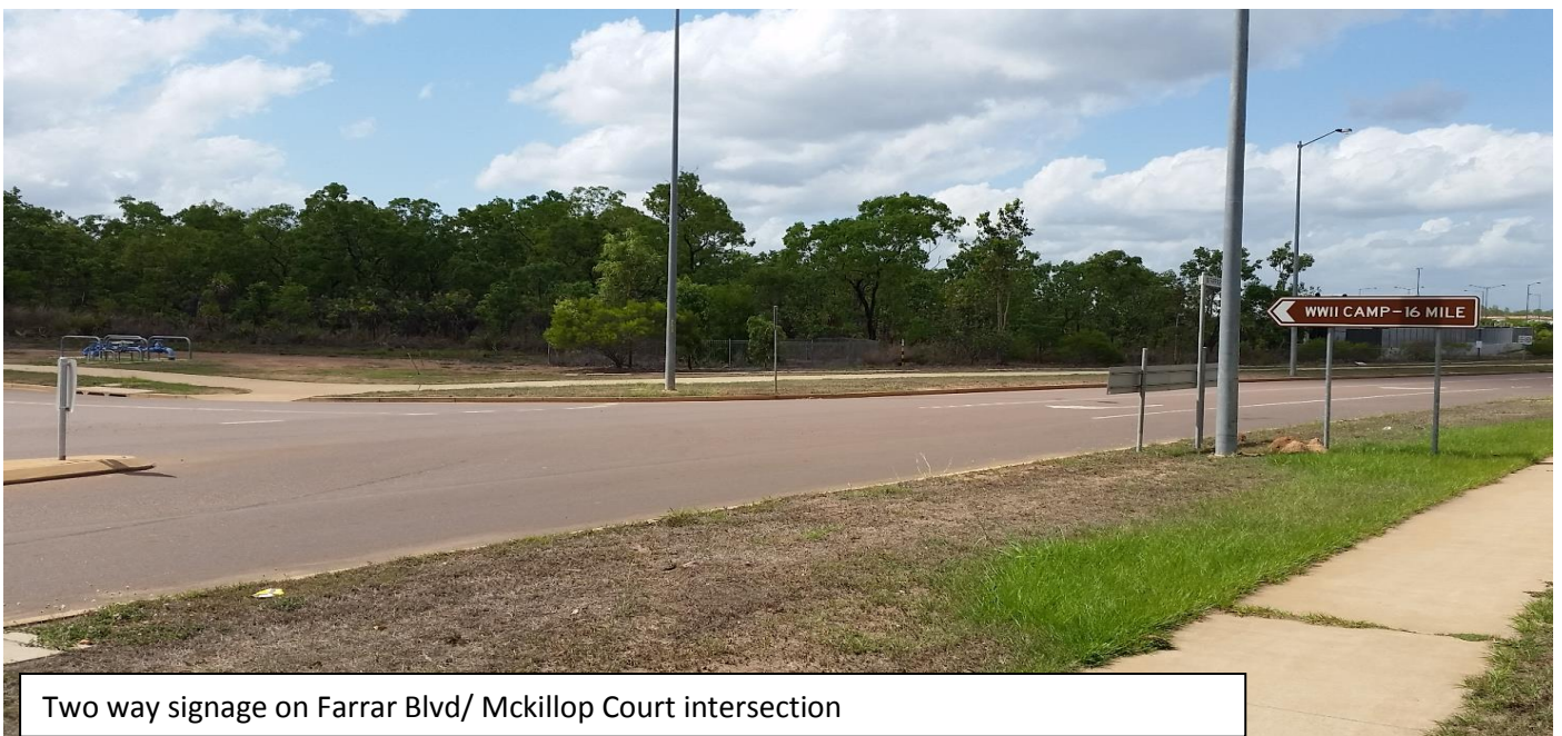
Two way signage on Farrar Blvd/ Mckillop Court intersection