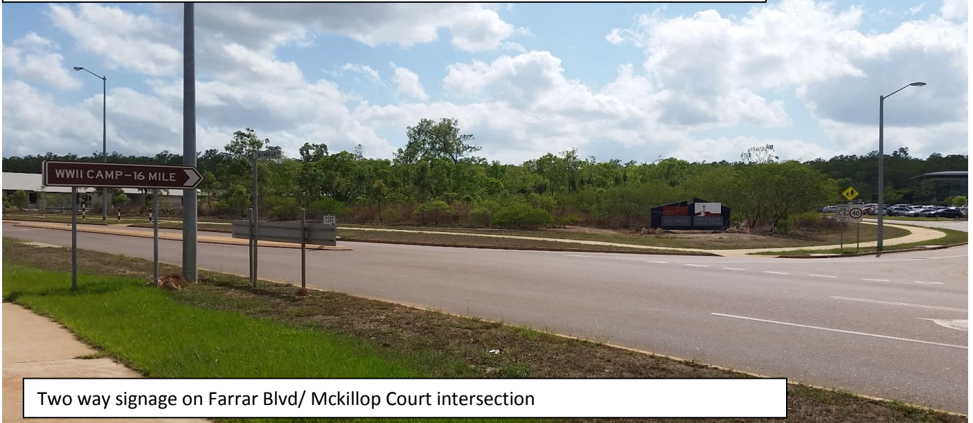
Two way signage on Farrar Blvd/ Mckillop Court intersection