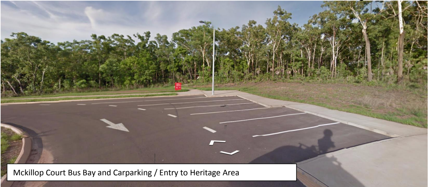
Mckillop Court Bus Bay and Carparking / Entry to Heritage Area