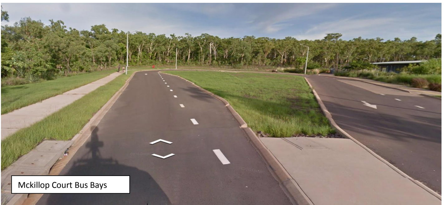
Mckillop Court Bus Bays