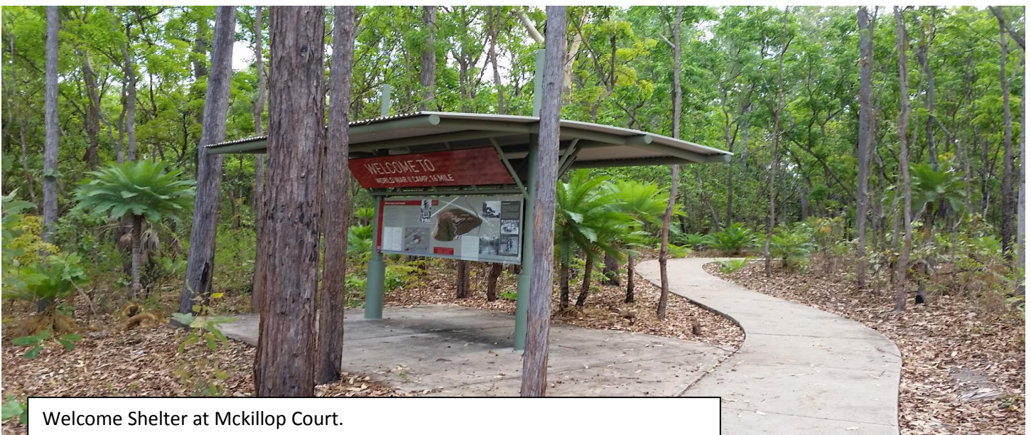
Welcome Shelter at Mckillop Court.