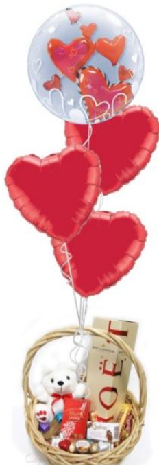
Balloon Delivery Example

(We are happy to add or change anything that is required).