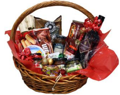
Gift Basket Example